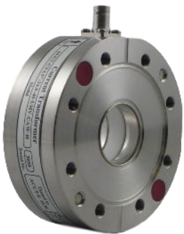
In-flange UHV installation in the beam line