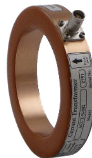
In-air installation over the vacuum chamber