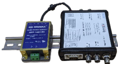
ACCT-E-RM-3R 3-selectable ranges