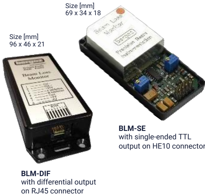
BLM-DIF with differential output on RJ45 connector