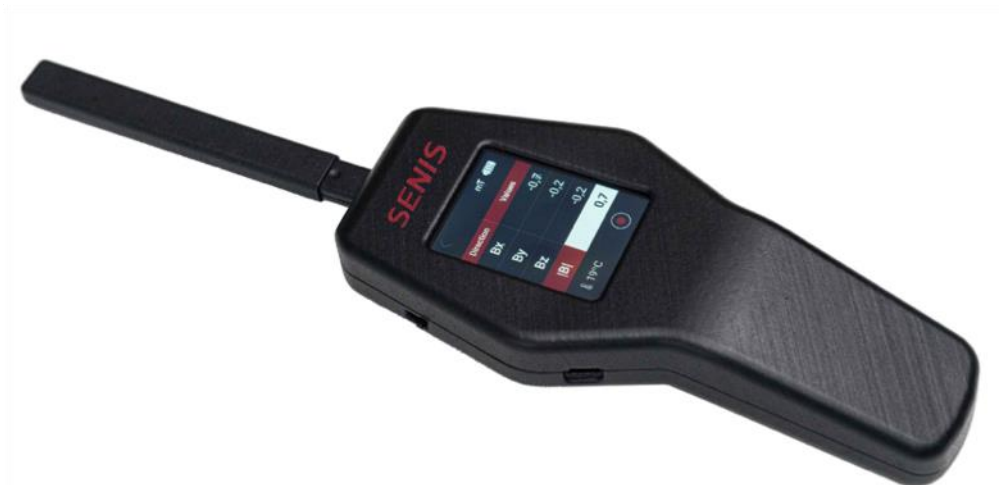
Figure 1: SENIS 3MH1 Handheld Teslameter

Due to unique features of the applied fully integrated 3-axis Hall probe, all three components of the magnetic field ( B_x , B_y , B_z ) are measured simultaneously at virtually same point. It allows users to perform a fast, high-resolution measurement of magnetic flux density of the magnetic fields. The measured values are presented on the device touch-display. The magnetic field sensitive area of the applied Hall probes is within a 100\ \mu\text{m} \times 100\ \mu\text{m} square, which allows measurements of homogeneous and highly inhomogeneous magnetic fields.