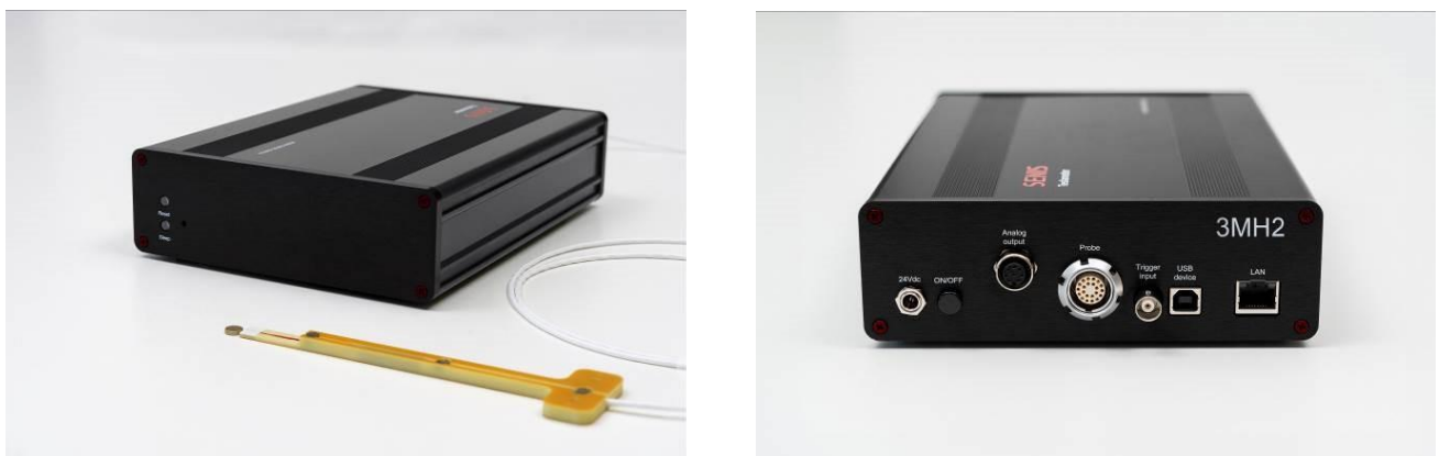
Figure 1: 3-channel digital transducer 3MH2: front panel (left); rear panel (right)

Featuring USB2.0 and LAN connectivity, a 24-bit A/D converter, and various triggering modes, the 3MH2 is ideal for mapping magnetic fields, characterizing undulator systems, current sensing, laboratory and production line applications, quality control and monitoring of magnet systems (generators, motors, etc.). Experience high-quality performance with the SENIS 3MH2.